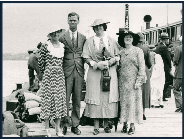
Image: Passengers of the MV Aorangi on the wharf of the Sydney Quarantine Station, 1935.