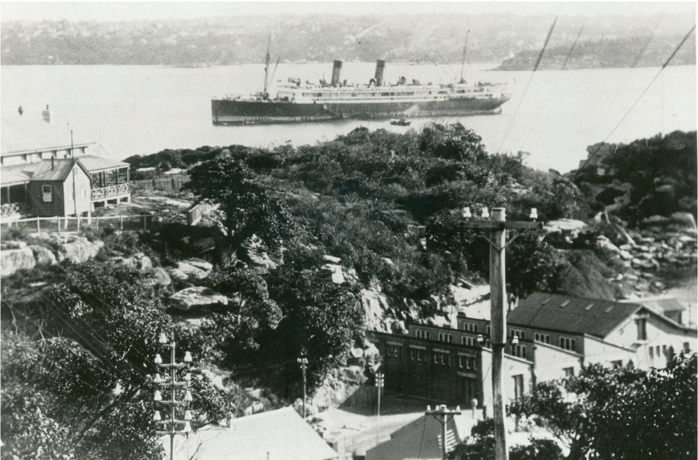
Image: The RMS Niagara at anchor in North Harbour off Sydney Quarantine Station, 1919. QS2007.195