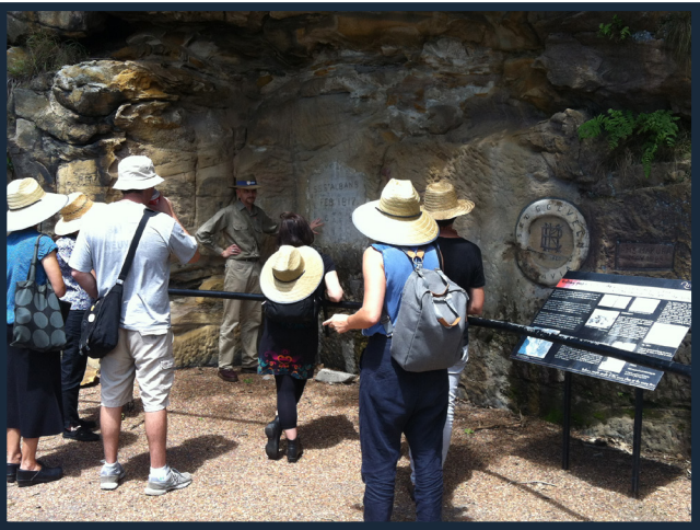
Images above: Site visit to the Q Station by the artists on 23 February 2015