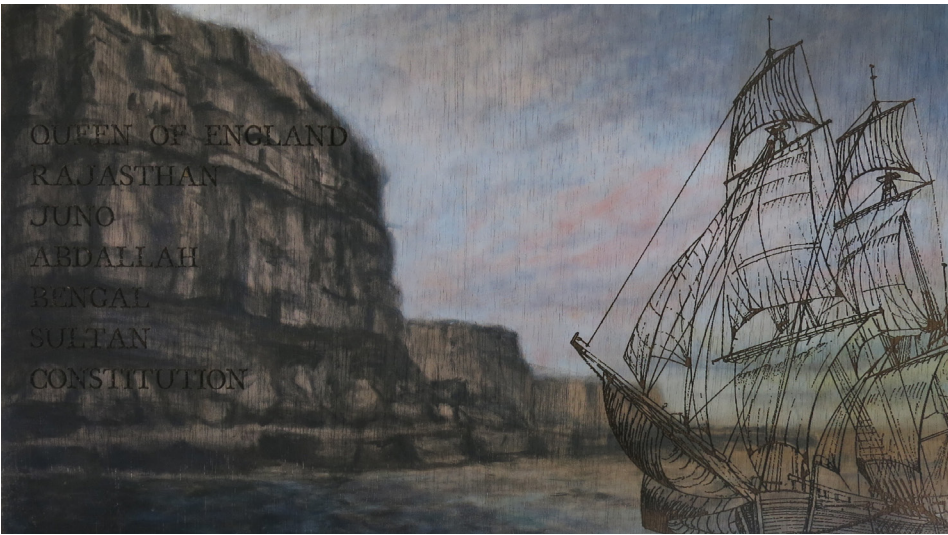
Image: Boree, ahead, oil on board laser engraved, 40 x 60cm

landscape and the 'unknown' for both the indigenous and Europeans by bringing together shared memories and two different points of reference; one from the land, the other from the sea. Traces of memories are engraved into the paintings and are a reminder of our impact and ongoing legacy.