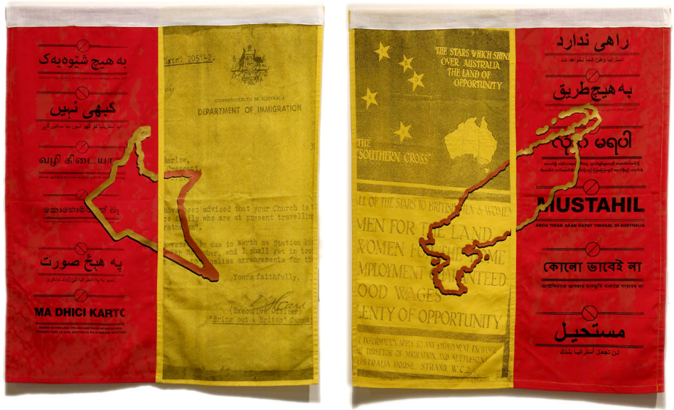
Image: No Way (Manly/Manus), 2015 acrylic silkscreen on cotton fabric, 250 x 120cm (each flag 100 x 120cm)

from a poster distributed by the Australian government's Department of Immigration and Border Protection and made available in numerous languages, including the ones shown on these flags.