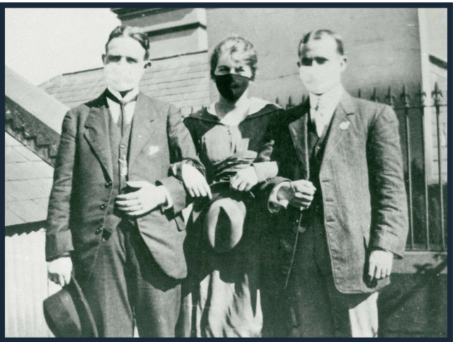
Image: Three people wearing face masks during the influenza epidemic in Sydney, 1919.