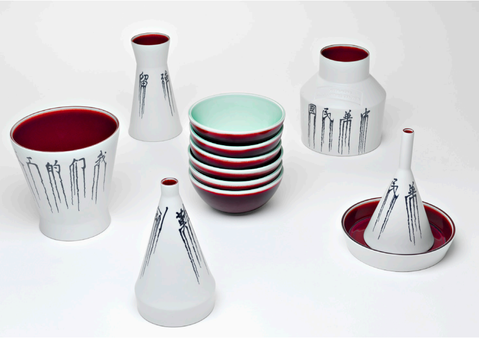
Image: Out of Quarantine, 2015, ceramic installation

China, were transported to Sydney. They act as metaphors for cultural difference, separation and transmigration. They also convey narratives, in the form of weeping Chinese characters, transcribed from the weathered